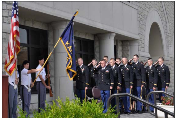
MAY 2010 COMMISSIONING